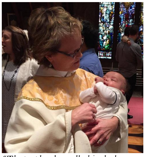
"The people who walked in darkness have seen a great light;

And yet, there are still so many people walking in darkness, amid the troubles of the world. But the message of Christmas is that we are not a people without hope, for the one whose light can never be overcome has been born to us, and the world will never be the same! Thanks be to God!